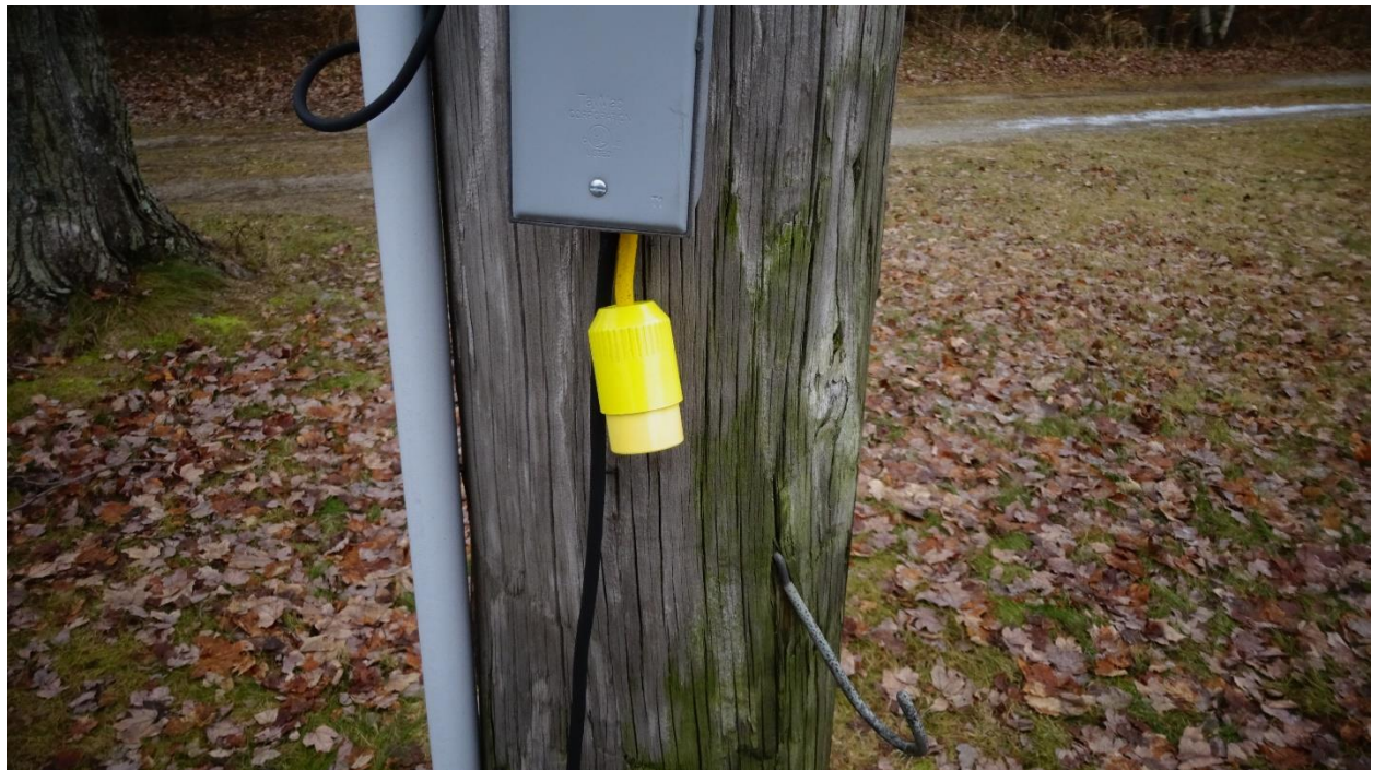
The cord with the pickle on it

6. plug in the cord w/pickle on it or the wireless controller with the throwing switch to the plug below the plug the pay manager.